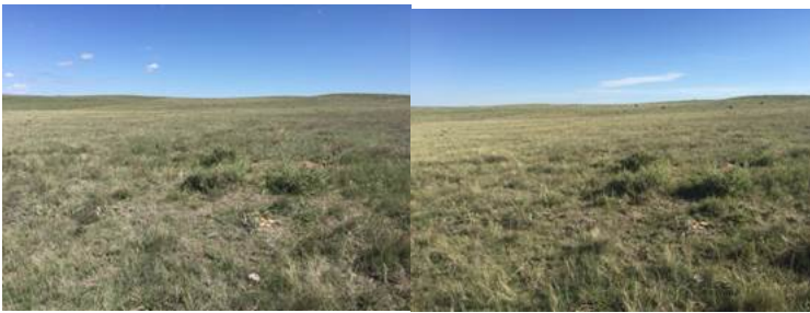
Pasture conditions in Ridgeline last week (left) and this week (right).