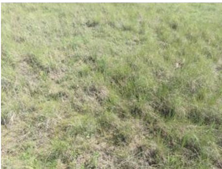
Pasture condition in Elm this week.

On behalf of the USDA-ARS-Rangeland Resources Research Unit, I thank you all for your continued participation in this project.